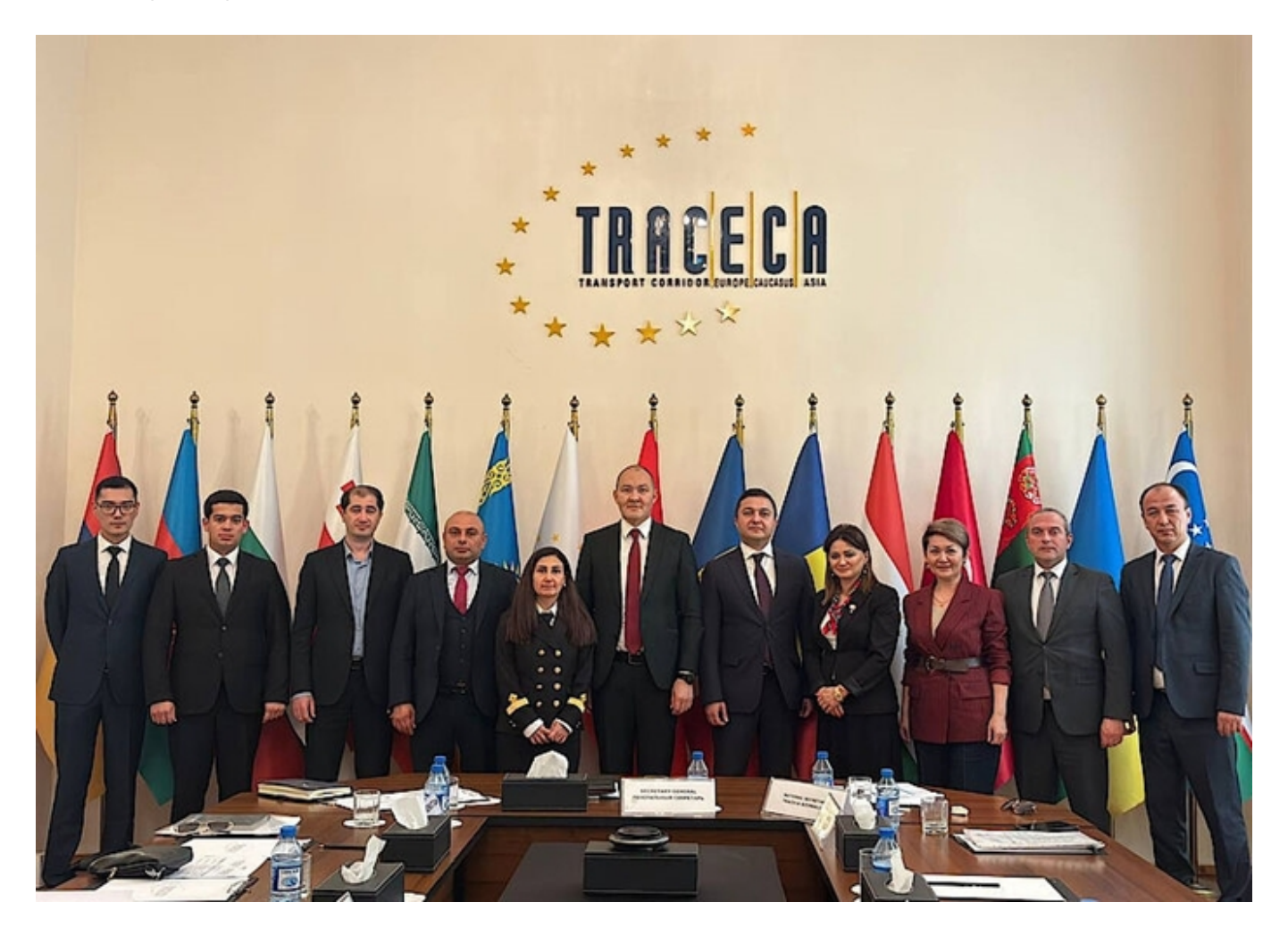
TRACECA is an internationally recognized programme uniting the transport system of 14 countries that have signed the "Basic Multilateral Agreement on International Transport for

The trilateral working group will continue its work on the realization of actions agreed at the meeting on an ongoing basis and regularly exchange information on progress towards achieving the goals set.